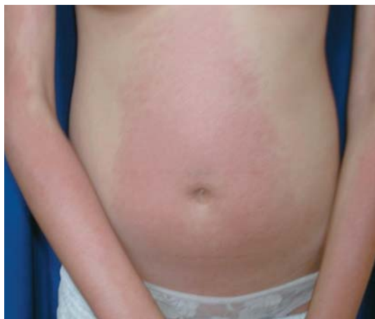
Figure 4 Rashes on the patient's arms and body

Her laboratory results were normal except for mild increase of lactate dehydrogenase (LDH) (456 U/L) and creatine kinase (CK) (20 U/L) as well as positive ANA test with speckled pattern. Anti-RNP was negative, neither anti-Jo-1 and anti-Scl-70. Skin biopsy of her femoral area revealed stratified squamous epithelium with atrophy and mild keratinization, with liquefactive degeneration of the basal layer in the center of the specimen. In dermis, a number of capillary arteries showed wall-thickening and fibrinoid degeneration. Masson's trichrome and van Gieson's stain showed thickening of some of the collagen fibrils. Direct immunofluorescence of skin biopsy specimen showed no immunoglobulin (IgG, IgA, IgM), complement component 3 (C3), or fibrinogen deposition. Electromyography (EMG) was also performed in this patient, but the result was within normal limit.