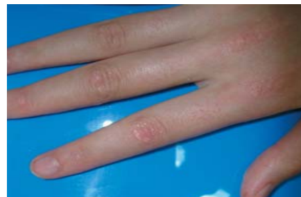
Figure 2 Sclerodactyly and Gottron's papules on PIP and DIP surface