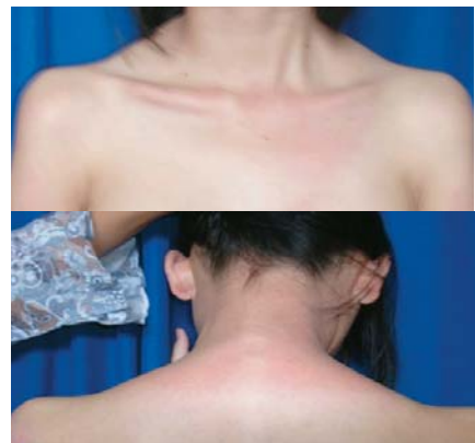
Figure 3 V sign and shawl sign