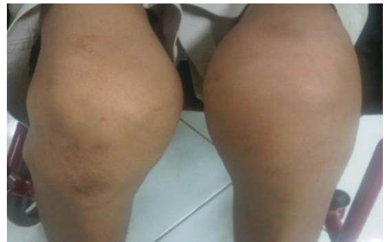
Figure 1. Physical examination revealed painful swelling of the left knee

knee and low Body Mass Index (BMI)16.5 kg/m 2 . Lung auscultation revealed signs of moderate rales. Examination of the left knee revealed a swollen warm knee, painful, restricted with reduced flexion ability and small amounts of effusion in the left knee joints (Figure 1).