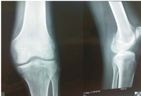
Figure 3. Anteroposterior and lateral radiographs of the knee showing is unremarkable other than a subtle soft-tissue swelling